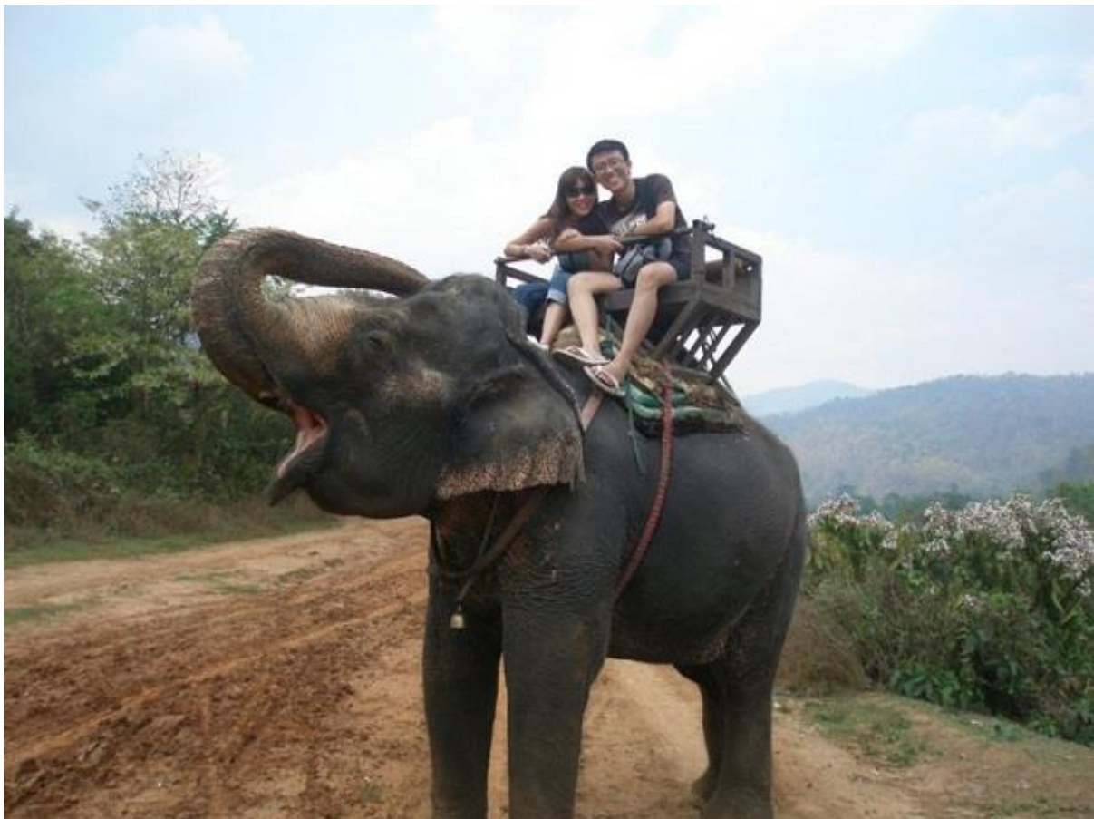
My paid for stay in Chang Mai (Thailand) in 2011 (a survey contest that I attracted)